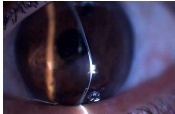
Figure 2 Left eye of the same patient demonstrates signs of pellucid marginal degeneration.