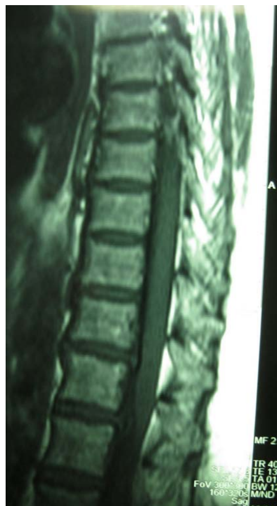
Figure 2. Post contrast MRI (1 st day)