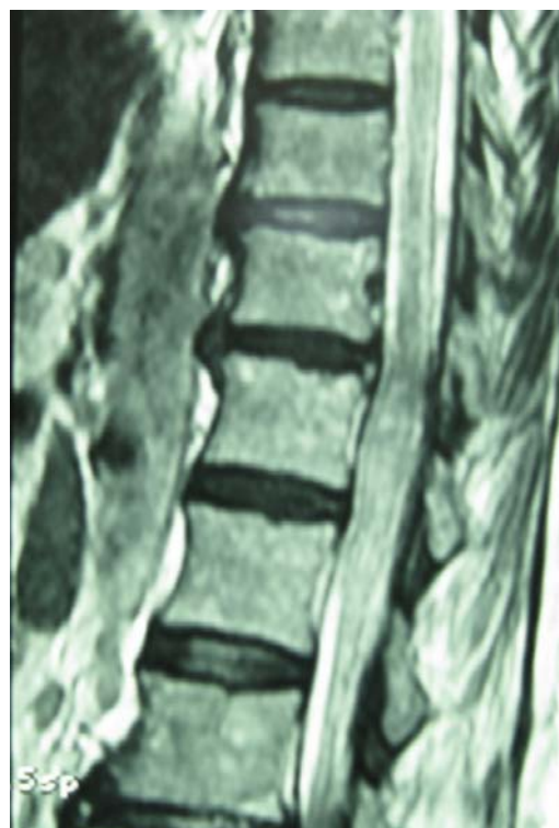
Figure 5. T2 MRI without contrast at thoracic level (above the lesion, 6 months later)

rehabilitation she is able to walk with walker for at least 200 meters.