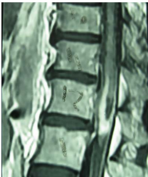
Figure 3. MRI with contrast from ischemic lesion (6 months later)