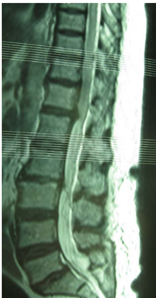
Figure 1. T2 MRI (day 1, without contrast). There is no lesion that could explain patient symptoms and signs.

NEG: negative ACL: anticardiolipin, APL: antiphospholipid CSF: cerebrospinal fluid WBC: white blood cells, RBC: red blood cells NEG: negative NL: normal