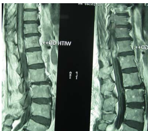
Figure 4. MRI with contrast (6 months later)

Work up to evaluate the possible causes of transverse myelitis was done on CSF and blood samples (Table 1). The patient received methylprednisolone 1000mg/day for 5 days and then 20 gram IVIG per day for 5 consecutive days.