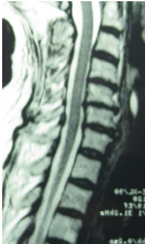
Figure 7. T2 MRI without contrast at cervical level(6 months later)