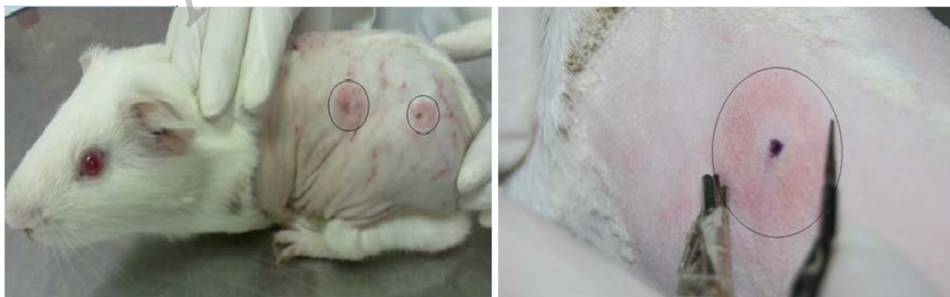
Figure 1. The red sign around the injection point 24 hours after intradermal injection