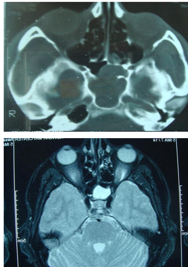
Figure 3. Brain CT scan and MRI of the patient There is a fullness of sphenoid sinus in CT scan and a high signal mass in T2 weighted MRI with compressive effect over adjacent tissues.