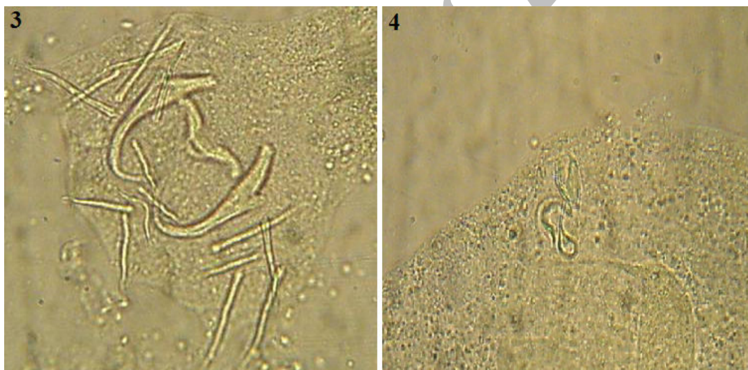
Figure 3: Anchors of Dactylogyrus lenkorani (X 298)