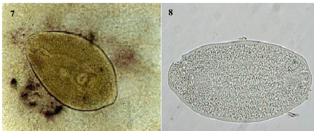
Figure 7: Metacercaria of Diplostomum spathaceum (194 X)