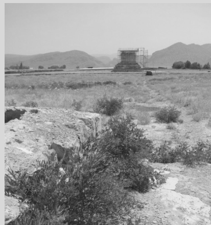
Figures 5 and 6. Parse- Pasargadae historical area.

Since 1960, many Qashqa'i have settled in local villages and towns, although often retaining pastoralism as one of their several means of livelihood. Despite the new places and patterns of residence for many of these settlers, most remained attached to their customary seasonal pastures, visited their kin there, and continued to exploit the resources, often in cooperation with these kin. Their winter and summer pastures are located in the valleys and on the slopes and plateaux of the "High Zagros" mountain. Mountain peaks rise above the nomads' camps, each of which is usually secluded by the rugged terrain. A typical campsite in winter pastures would contain three woven goat-hair tents with slanted roots to deflect rain and snow. The black tents were pitched on flat areas on the slopes of gullies to protect the