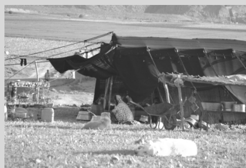
Figure 7. A typical campsite in winter pastures contained three woven goat-hair tents with slanted roots to deflect rain and snow.

occupants and their possessions from flash floods while also still providing some shelter from wind (Beck, 2001) (Figure 7).