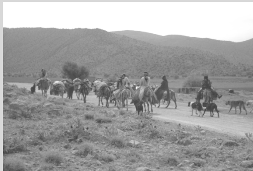
Figure 3. Qashqa'i pastoralists have chosen the seasonal migration in harmony with the nature.

Considering the strong link between the natural environment and the cultural communities formed in