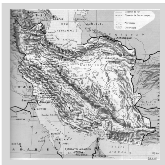
Figure 1- Map of Iran (Larousse, 1986)

Iran is a mountainous territory formed during the Tertiary-Quaternary period by Alpine orogeny. Through the collision of the Neotethys, an ocean lying between Eurasia, and Gondwanaland (Afro-Arabia) a large bowl-shaped continental plateau has been formed. Although this plateau is a high land with several mountain ranges, and hinterland plays and lakes, its marginal zones (Alborz and Zagros) are much higher where they surround a vast territory with Isberg-type peaks and wide plains forming upper-lower correlated systems (Figure1) (Kinsely, 1970).