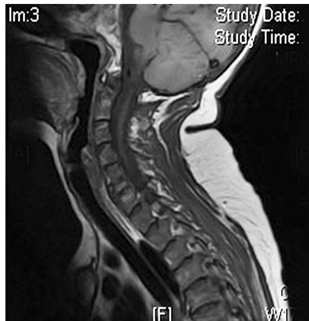
Figure 2. Magnetic resonance imaging demonstrated bone infiltration of the 4th and 5th cervical vertebrae with large paravertebral and intraspinal soft tissue masses and neural compression.

After 2 years of hemodialysis, she presented with persistent neck pain, which was associated with numbness and tingling of both lower limbs, especially on walking, and root pains in both upper limbs. Physical examination revealed muscle weakness and hypotonia of both upper limbs. Laboratory studies revealed elevated serum alkaline phosphatase (322 IU/L), parathyroid hormone (2600 pg/mL), and phosphate (6.8 mg/dL) levels. Serum calcium level was 9 mg/dL. Cervical plain radiography showed demineralized lesion affecting the 4th and 5th cervical vertebrae. Magnetic resonance imaging demonstrated bone infiltration of the cervical vertebrae with large paravertebral and intraspinal soft tissue masses with neural compression (Figure 2). Parathyroid