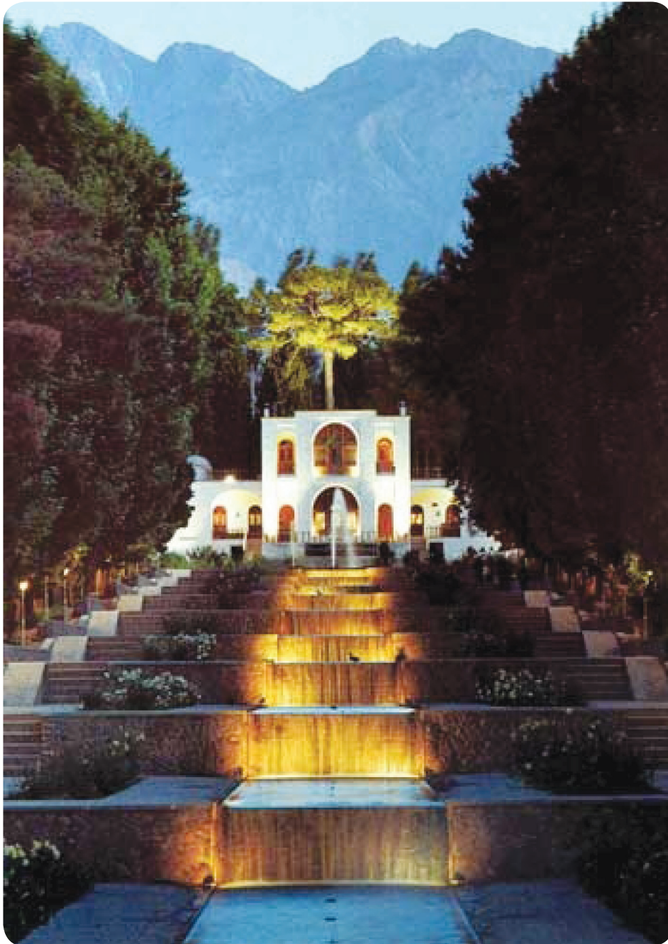
Bagh-é Shahzadeh, 19th century –Kerman, Iran