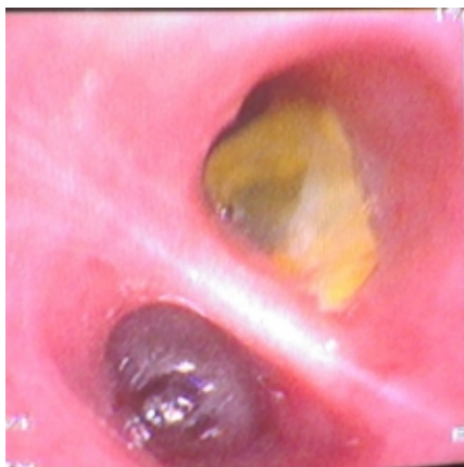
Fig. 2: Whitish-yellow bright gelatinous membrane in the video-bronchoscopy