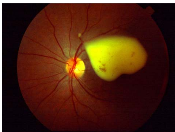
Figure 3. Longstanding premacular hemorrhage

Twelve out of fourteen patients (85.7%) in successful laser group in our study had complete visual recovery (BCVA ^{20}/_{20} ). One of our patients with long duration of valsalva premacular hemorrhage (with duration of 4 months) had a yellow color change of hemorrhage (Figure 3) as was mentioned in other studies. 17