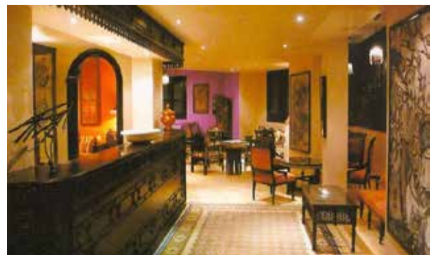
Fig. 5. Tourist accommodation on Al-Moez Street.

This paper discussed the authenticity of the heritage sites from two perspectives: principles of