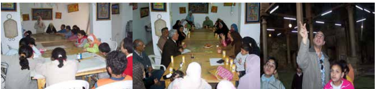
Fig. 6. Authorities are explaining conservation measures to locals, children and students.