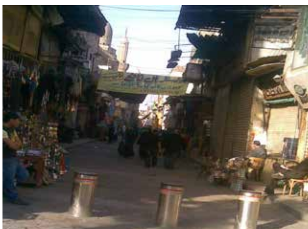
Fig. 3. Al-Moez Street with traffic restriction during the day.