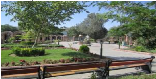
Complexity M = 1.78, SD = 1.22