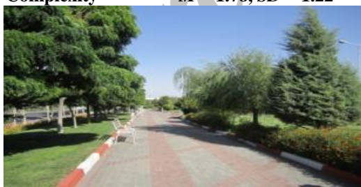
Legibility M = 2.10, SD = 1.24