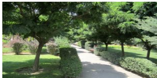
Mystery M = 1.52, SD = 1.04