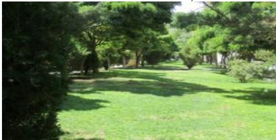
Refuge M = 1.59; SD = 1.04