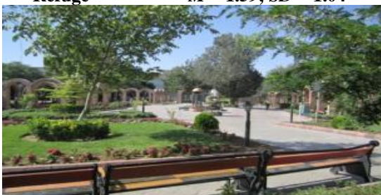
Complexity M = 1.78, SD = 1.22