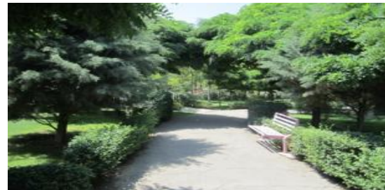
M = 1.57, SD = 1.00