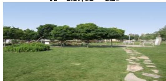
M = 2.09, SD = 1.23