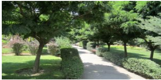
Mystery M = 1.52, SD = 1.04