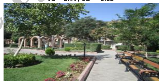
M = 1.80, SD = 1.18