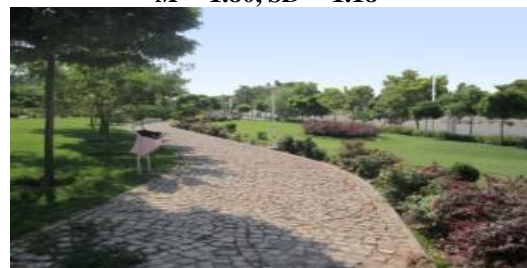
M = 2.16, SD = 1.26