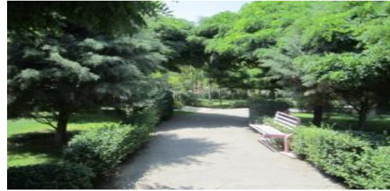
M = 1.57, SD = 1.00