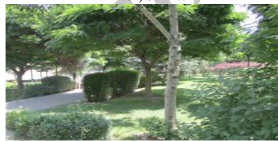
M = 1.80; SD = 1.12