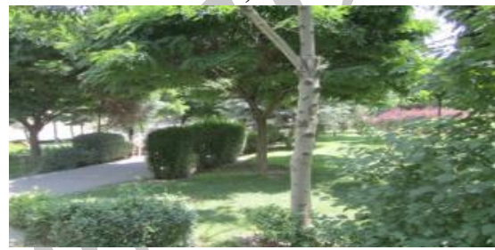
M = 1.80; SD = 1.12