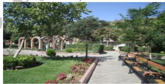
M = 1.80, SD = 1.18