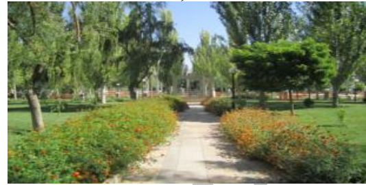
M = 1.67, SD = 1.02