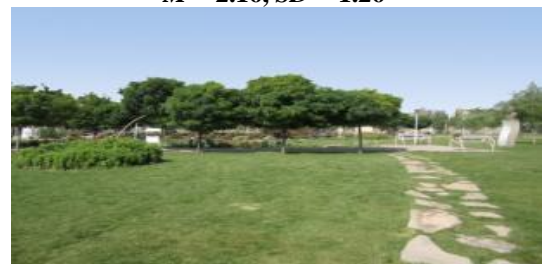
M = 2.09, SD = 1.23