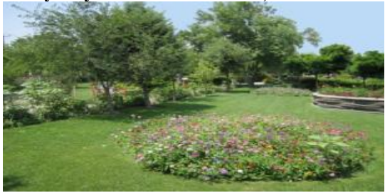
Coherence M = 1.54, SD = .95