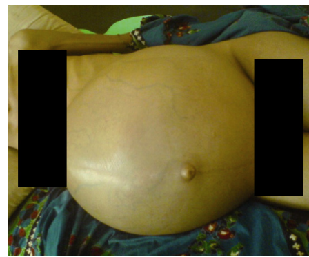
Figure 1. The patient's abdomen at presentation

She had intravenous crystalloids and two units of fresh whole blood intra-operatively. Her post-operative recovery was uneventful. The packed cell volume on the 3 rd post-operative day was 30%. Abdominal skin stitches were removed on