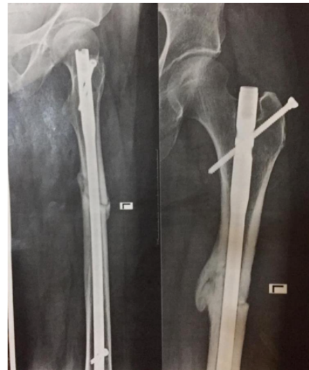
Figure 4. A and B: Femoral shaft Fracture and internal fixation