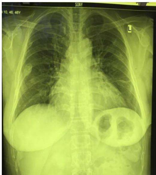
Figure 2. Multiple rib fractures