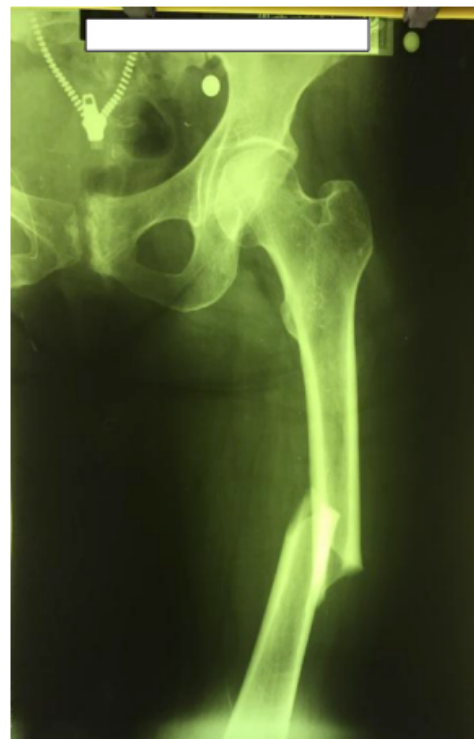
Figure 1. First femoral fracture four years ago

Abdominal ultrasonography and pap smears were normal. Upper and lower endoscopy assessments also showed no significant abnormal finding. There were no remarkable findings in spiral thoracic-abdominopelvic CT scan, spinal Magnetic Resonance Imaging (MRI), mammography, serum and urine protein electrophoresis, and immunofixation. On the other hand, a whole-body bone scan showed multiple fractures possibly due to metastasis. Upper and lower endoscopy assessments also showed no significant abnormal findings. Cancer Antigen 125 (CA125), Alpha-Fetoprotein (AFP), Lactate Dehydrogenase (LDH), CA19-9, and Carcinoembryonic Antigen (CEA) levels were 11.8, 1.9, 292, 1.3, and 1.3, respectively.