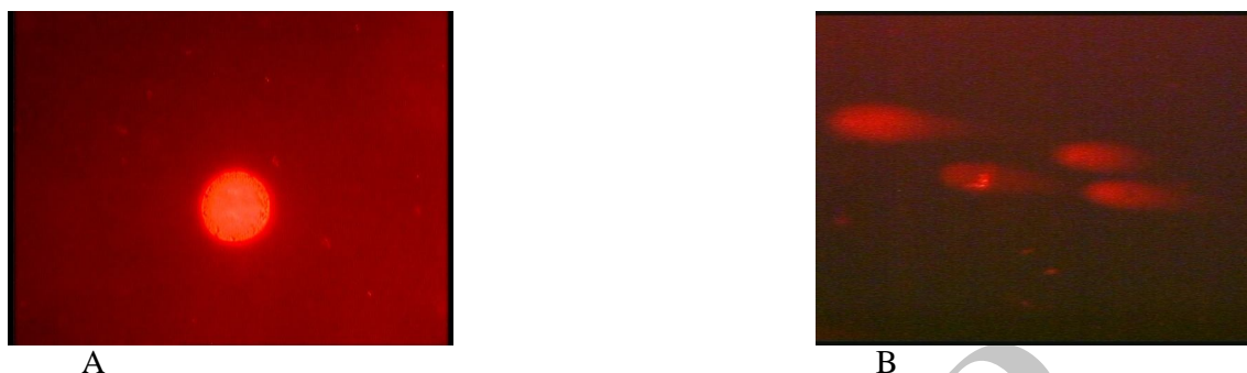
Figure 1. Image from comet assay on kidney cells: (a) A normal kidney cell; no DNA breakage and movement and (b) kidney cells exposed to Cd: significant breakage and movement of DNA following the comet assay