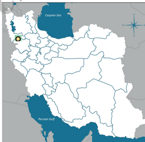
Fig. 2: Case study Region.

latitude and the height from the see is nearly 1496 meters (Fig. 2). According to the last official census (2012), the population of Saqqez is nearly 208,425 which among these, 150000 live in city center and the rest live in other towns of the city. The city area is equivalent to 15.49 % of the total province area. Saqqez is surrounded by West Azerbaijan in North and West, by Marivan and Iraq in South, by Divan dare in East (Consulting Engineers of Piravesh, 2007).