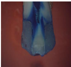
Figure 2 - Dye penetration in samples 3 and 4 in group 5