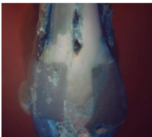
Figure 3 - No dye penetration in samples 1 and 2 in group 1