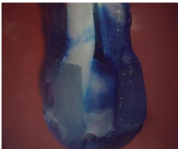
Figure 4 - Dye penetration in samples 5 and 6 in group 6