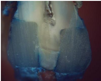
Figure 5 - Dye penetration in samples 3 and 4 in group 4

Microleakage is an important parameter affecting the success rate of restorative materials. Considering the clinical significance of microleakage and introduction of bulk-fill composites to the market, we selected two types of bulk-fill composites in the current study, which have been less commonly assessed in the