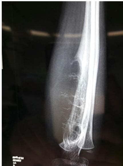
Figure 1. X-ray image showing bone tumor in ulna that destructs the one cortex and fine bony trabeculation the extend to soft tissue.