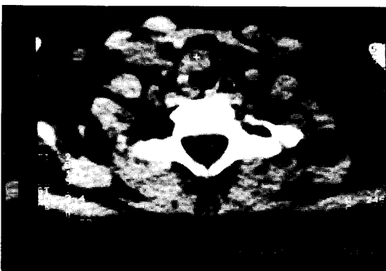
Fig 1. Ct scan shows an intratracheal mass

The patient underwent tracheal resection through a transverse cervical incision. Surgeon cut the thyrioid isthmus and tumoral mass was thyrioid isthmus and tumoral mass was explored. The mass was located at the beneath of the right-lobe. Specimens were obtained from the adjacent thyrioid tissue, the upper margin (cricoid), and the lower margin (trachea) were sent to pathology department for frozen section, however, all the four samples were revealed to have no tumoral involvement. About 3.5 cm of trachea was resected and end-to-end anastomosis