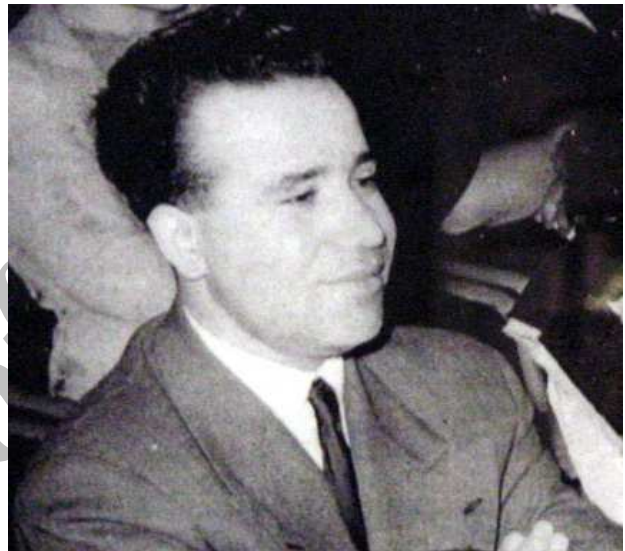
Figure 3. Dr. Mohammad Ghazi Tehrani (b. 1921).

University education of medical students regarding tuberculosis existed even before the modern organization of medical schools (1939) (15). Since the early 1940s, tuberculosis has been taught to medical students in their 5 th year of medical training (16).