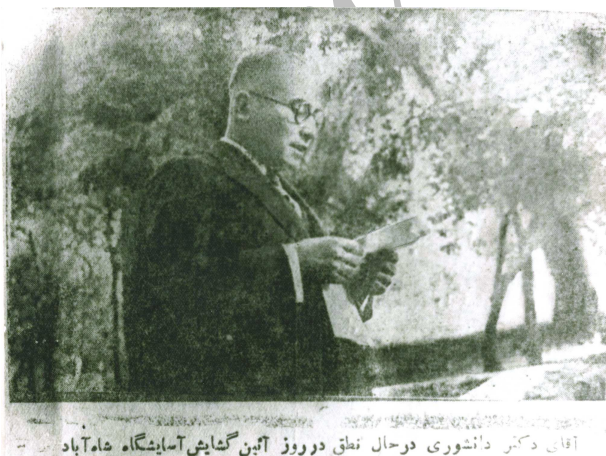
Figure 1. Dr. Masih Daneshvari is opening the Shah Abad Hospital (17 Aug. 1937).

Treatment methods such as collapse therapy which were popular in European countries were unknown in Iran and were only prescribed for some aristocrats and princes by foreign physicians. The first steps for helping TB patients were taken in the early 20 th century. Dr. Masih Daneshvari (1899-1976) completed his education in the field of pulmonology and tuberculosis and returned to Iran in October 1934. His return was a turning point in initiation of modern treatments in the field of tuberculosis in Iran. Shah Abad Sanitarium was established as recommended by Dr. Daneshvari in 1937 (Figure 1) (11).