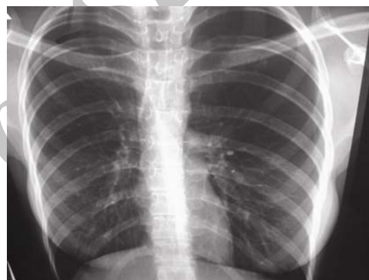
Figure 3. Chest X-ray after one-year showed no visible residual cysts.

pleural cavities were thoroughly irrigated with hypertonic saline. A chest tube was placed and the chest was closed primarily. Two cysts in the right side were evacuated similar to those in the left side. The two liver cysts were evacuated with phrenotomy. Two Foley catheters were placed in the cavity of liver cysts after evacuation. To reduce recurrence in the postoperative period, Albendazole was given for 3 months. Her postoperative recovery was smooth with no evidence of sepsis, pneumonia or bronchiectasis that. These complications sometimes occur after conservative parenchyma saving lung procedures. At one-year follow-up, the patient showed complete resolution of all symptoms and well expanded lungs with no residual cysts visible on the chest X-ray (Figure 3).