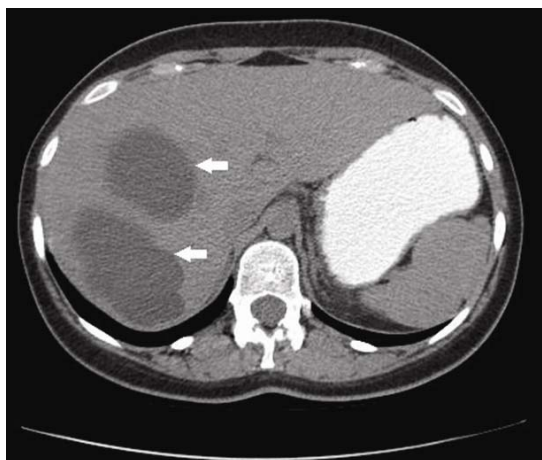
Figure 2. CT scan revealed two large cysts in the right lobe of the liver (white arrow).

Due to the symptoms caused by these cysts, the cysts were decided to be treated surgically. The patient underwent separated bilateral antero-lateral thoracotomies and phrenotomy under general anesthesia with double lumen and tracheal tube in the supine position. First, we operated the left side pulmonary cyst. Intraoperatively, cysts were found to be hydatid cysts, they were first aspirated and then evacuated. Laminated membrane and bronchial opening were closed with capitonage. The