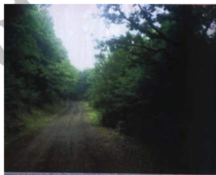
Figure 2: Photograph of Semnan Darband cave