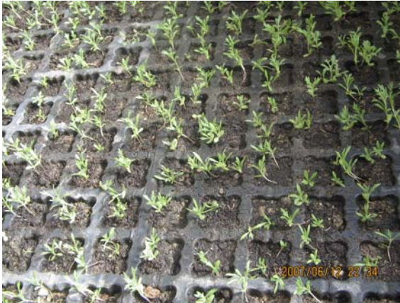
Fig. 2. Cultivation Dishes Cells (dimples) Used to Plant Seeds of A. sieberi

Two months after growing in pots, 16 plants were selected and transferred to field. University field soil and climate were similar to the habitat of seed collection site. Two months later, 16 seedlings were transferred to field soil. The sides of the pots were cut and the passage of water into the bags was open. Watering was done every 40 days. The number of the seedlings established in the field was counted and the percentage of the establishment was calculated.