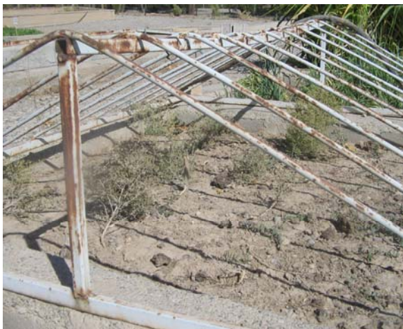
Fig. 4. Seedlings of Established in Experimental Site at the University Field

seedlings should have enough strength and reserves to survive the unfavorable conditions of new habitat.