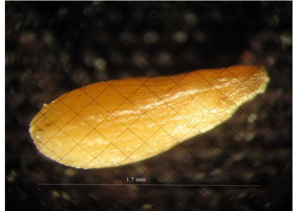
Fig. 3. Morphology of Seeds of A. sieberi from Kolah Ghazi National Park, Bar in Each Graph Indicates 1.7 mm.