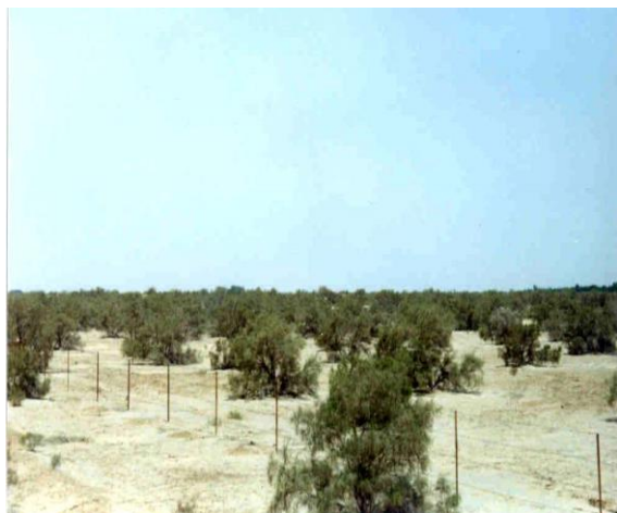
Fig. 2. A view of the study area in research project ( before pruning in fall of 1994)