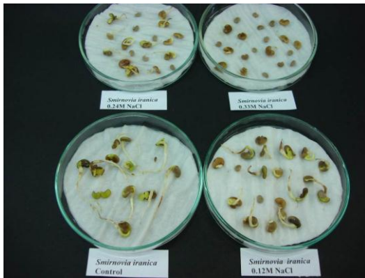
Fig. 4. Effects of salt concentration on seed germination of Smirnovia iranica