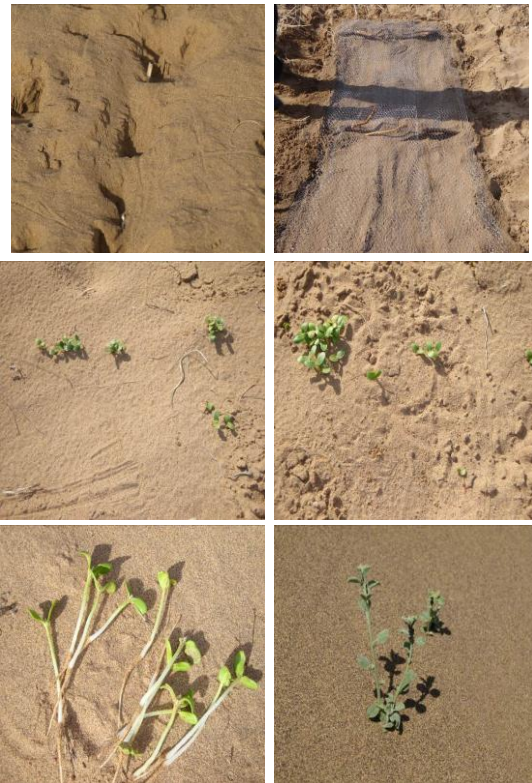
Fig. 3. Seed sowing method (pitting), and covering seeded area with a thin steel mesh (top), seed germination and seedling growth (middle), thinning the bunched seedlings (bottom left) and establishment of young Smirnovia iranica plants in natural habitat (bottom right)