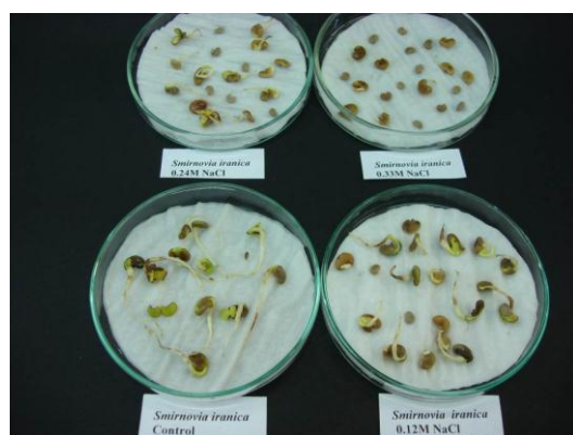
Fig. 4. Effects of salt concentration on seed germination of Smirnovia iranica