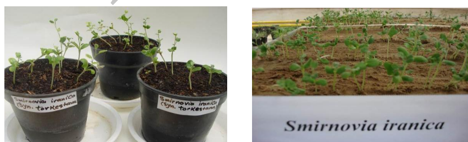
Fig. 2. Smirnovia iranica seeds germinated and developed to seedlings into pots (left) and glass box (right) under greenhouse conditions

sown in 4 different dates from 2007 to 2009 (see Materials and Methods), only the seeds sown on 7 th December 2009 were germinated and continued to grow. The germinated seeds were developed to normal seedlings in spring 2010 (Fig. 3, Middle). In early spring, the seedlings were thinned to 1 plant per pit (Fig. 3, Bottom left). Only a few seedlings were grown into young normal plants (Fig. 3, Bottom right). Although the number of the established plants was low (approx. 5%), the results looked promising.