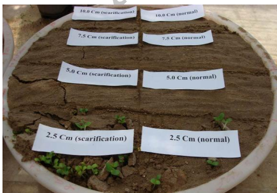
Fig. 5. Effect of seed sowing depth on Smirnovia iranica seed germination (13 days after seed sowing)

Although the main objective of this experiment was to show the depth effects on seed germination and seedling growth, the effects of seed scarification on seed germination and seedling growth was also evaluated. The best seed sowing depth for seed germination was 2.5 cm in scarified seeds (Fig. 5). Although seed germination and seedling growth in Control (non-scarified) seeds were observed, the number of seedling was significantly lower than those of the scarified seeds. Seeds of the 5.0 and 7.5 cm sowing depth germinated and developed to seedlings in a longer time (20 and 25 days, respectively). However, in 10 cm sowing depth, germination was longer and the number of the germinated seeds and seedlings was significantly low.