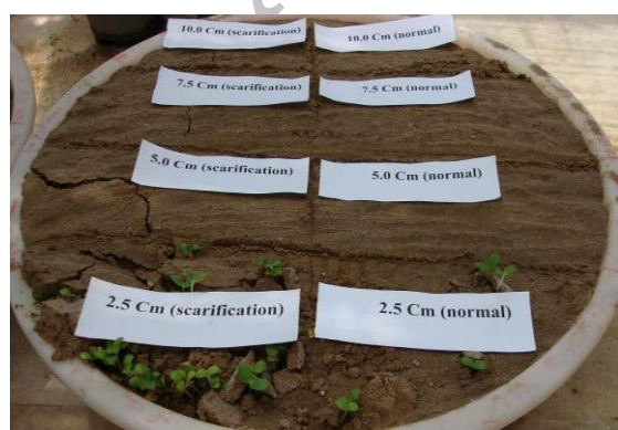
Fig. 5. Effect of seed sowing depth on Smirnovia iranica seed germination (13 days after seed sowing)

Although the main objective of this experiment was to show the depth effects on seed germination and seedling growth, the effects of seed scarification on seed germination and seedling growth was also evaluated. The best seed sowing depth for seed germination was 2.5 cm in scarified seeds (Fig. 5). Although seed germination and seedling growth in Control (non-scarified) seeds were observed, the number of seedling was significantly lower than those of the scarified seeds. Seeds of the 5.0 and 7.5 cm sowing depth germinated and developed to seedlings in a longer time (20 and 25 days, respectively). However, in 10 cm sowing depth, germination was longer and the number of the germinated seeds and seedlings was significantly low.