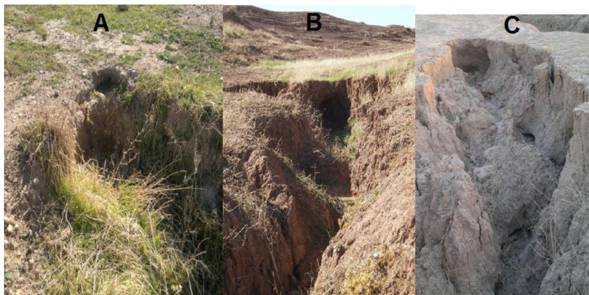
Fig. 2. Gully erosion in the study area. A= fare rangeland, B= weak rangeland and C= agricultural area

Means of rows with the same letters are not significantly different at P < 0.05\%