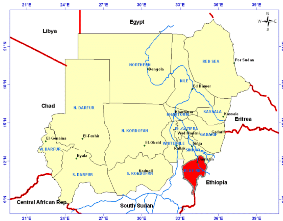
Fig. 1. Map of Sudan, the Location of the study area is highlighted with red color