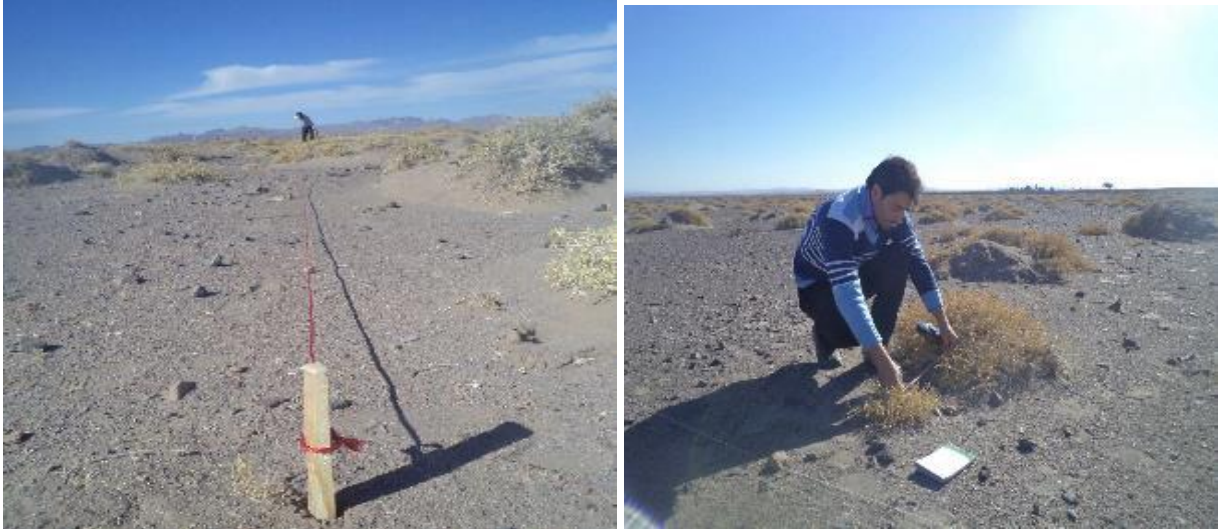
Fig. 2. Transect establishment and a general outlook of the studied rangelands

distribution patterns, they have been used to determine the accuracy of distance and quadratic indicators for the three species of interest in this research.