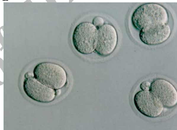
Figure 3D&E. Completion of the second meiotic division (MII) after 24h culture. (D). A fertilized 2-pronuclear zygote (E). A cleaved embryo at 24h post fertilization. All pictures taken under Hoffman contrast optics. Original magnification: ×320: B×200. Bar=32 μm.