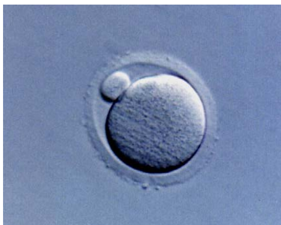
Figure 2C. Denuded GV stage oocyte. magnification: ×320: B×200. Bar=32 μm.

Table I shows the number of oocytes arrived to MII stage (Figure 2C) after 24hr culture. The maturation rate of COC was significantly higher than that of DO (p<0.05).