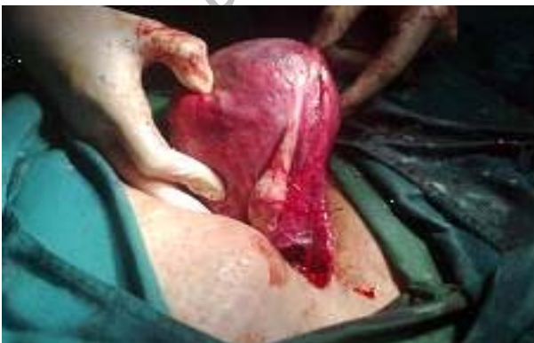
Figure 4. Normal right adnexa without any adhesion or hydrosalpinx is seen during cesarean section.