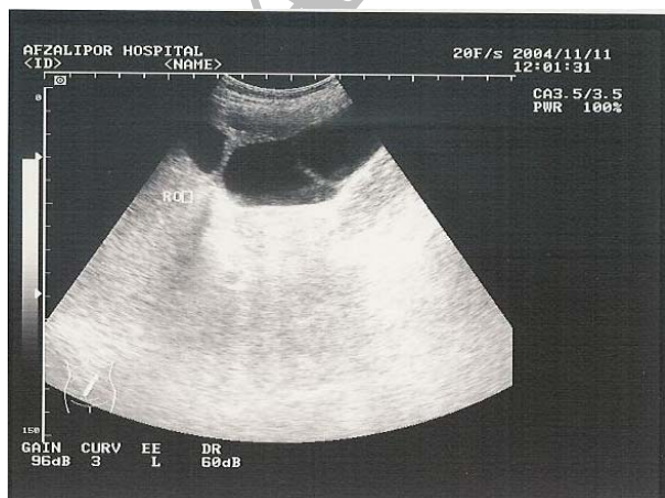
Figure 1. Hyperstimulated ovary with multiple large cysts.