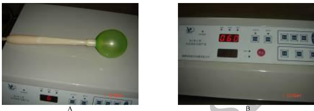
Figure 1. Illustration of the air bag bionic midwifery instrument. (A) Latex gasbag; (B) Control panel.

The data were analyzed using SPSS (version 12.0, SPSS Inc., USA). Student's T-test and Chi-square test were used for data analysis.