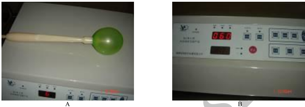
Figure 1. Illustration of the air bag bionic midwifery instrument. (A) Latex gasbag; (B) Control panel.

The data were analyzed using SPSS (version 12.0, SPSS Inc., USA). Student's T-test and Chi-square test were used for data analysis.