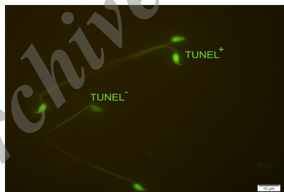
Figure 3. TUNEL assay of mice spermatozoa. TUNEL^+ indicates apoptotic spermatozoa and TUNEL^- indicates non apoptotic spermatozoa ( \times 100 eyepiece magnification).