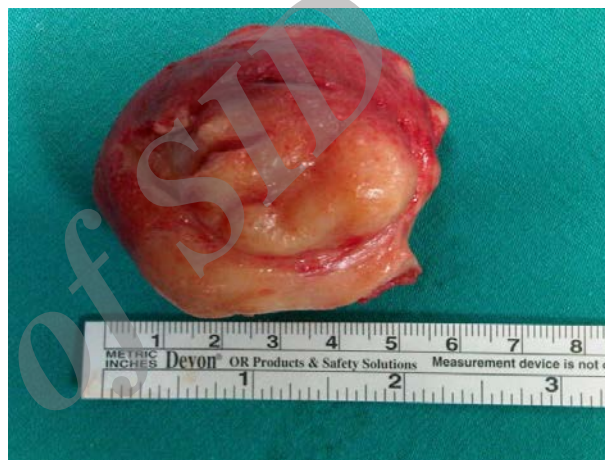
Figure 2. Dimension of myoma.

After clamping the peduncle, 5x6 cm mass was removed. Vaginal defect was repaired with absorbable 2/0 polyglactin 910. Histopathologic evaluation confirmed leiomyoma with degeneration and inflammation (Figure 2). The postoperative course was uneventful and she was discharged without any complication on the second postoperative day. Postoperative ultrasonographic examination revealed a normal pelvic texture.