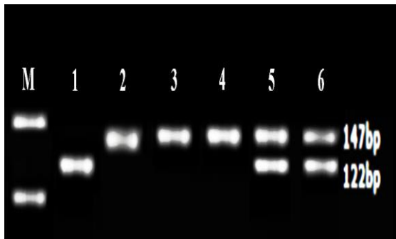
Figure 2. The enzyme digestion pattern of rs2910164. M is 50-bp size marker; Lane 1 is wild-type homozygous alleles (C/C); Lane 2, 3 and 4 are mutant type homozygous alleles (G/G); Lane 5 and 6 are heterozygous alleles (C/G).