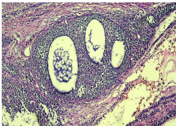
Figure 3. Histologic findings showed granulosa cell with ovoid nuclei and nuclear grooves with microfollicular pattern /HE*100MAGNIFIED 100 TIMES.