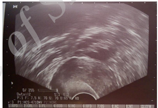
Figure 1. Sonography before induction of ovulation-normal ovary without dominant follicles.

An informed consent was obtained from the patient for publication of this case report and accompanying images.