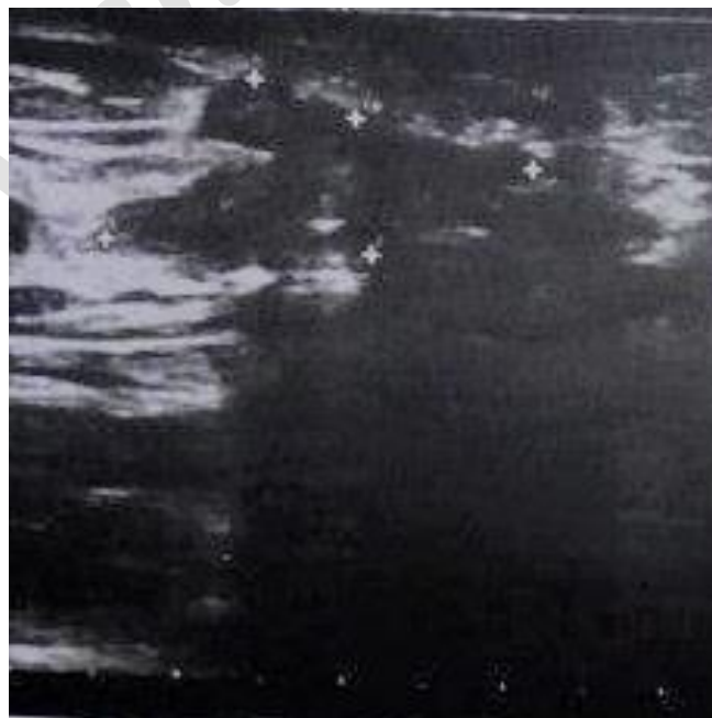
Figure 2. Ultrasonography image shows a 26x12x25mm vascularized, hypoechoic, irregular in shape lesion in the abdominal wall, 7mm deep to the skin.