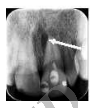
Figure 3 - the first month follow-up, periapical rarefaction compared to the primary radiographic image

non-symptomatic on 1, 3 and 6 months follow ups. Decreased periapical rarefaction was evident on radiograph in the first month (Figure 2) and it was minimized in the third month (Figure 3)