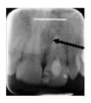
Figure 4 - resolving periapical rarefaction and bone formation in the area

and was totally resolved in the sixth month of follow up. Also, thickening of apical dentinal walls, increasing closure was seen during