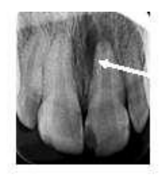
Figure 1-Primary radiograph

Intraoral examination revealed no abnormality or swelling in soft tissue. The mentioned tooth was not discolored and was not sensitive to cold and electric pulp tests. A mesial coronal fracture was evident due to last year trauma. In periodontal examination, probing depth was in the normal range. The radiographic examination showed periapical rarefaction, immature root with open apex. (Figure 1)