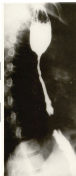
Figure 2: GI series of patient

nonspecific esophagitis. Esophageal manometry was not available. Colonoscopy was normal. She was treated with conjugated estrogen, growth hormone, oral ferrous sulfate, vitamin supplements and repeated esophageal dilatation with marked improvement.