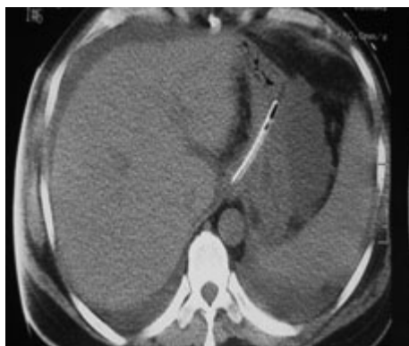
Fig.4: No lesions were visualized in the liver. Note the presence of ascites fluid surrounding the liver.

Following laparotomy, the patient was returned to the ICU where vasopressor, mechanical ventilation, daily hemodialysis and enteral feeding were continued with no improvement in the patient's condition and after 15 days, he died.