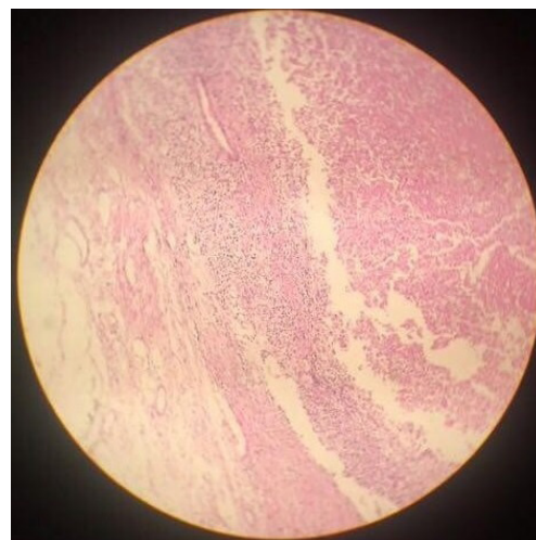
Fig.4: Coagulative necrosis and histiocytic reaction

to the right thyroid lobe, most likely from a parathyroid origin. Subsequently, sestamibi scan with technetium 99m (99 mTc) was indicative of a parathyroid adenoma in the right thyroid lobe.(figure 1) Based on the clinical, laboratory, and imaging revelations, and probable parathyroid carcinoma, the right thyroid lobe was resected 7 days after admission.