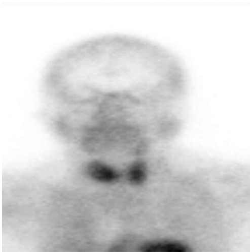
Fig.1: Sestamibi scan with Technetium 99m (99mTc) of a parathyroid adenoma in the right thyroid lobe.