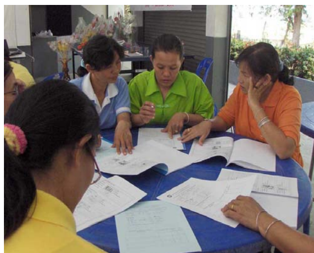
Figure 3: Checklist exercise and a discussion about work practice improvement

In terms of working conditions, the results show that the working conditions of the groups improved to reach governmental standards. A working condition improvement process using the WISE technique was implemented in the study. The WISE technique uses participatory methods to find practical and feasible improvements. Krungkrai Wong et al. argue that the WISE technique can effectively reduce the risks of informal-sector workers and small-scale enterprises. 17 Also,