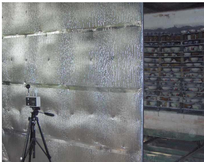
Figure 2: Measurement of thermal conditions behind a heat barrier

working conditions to meet necessary standards.