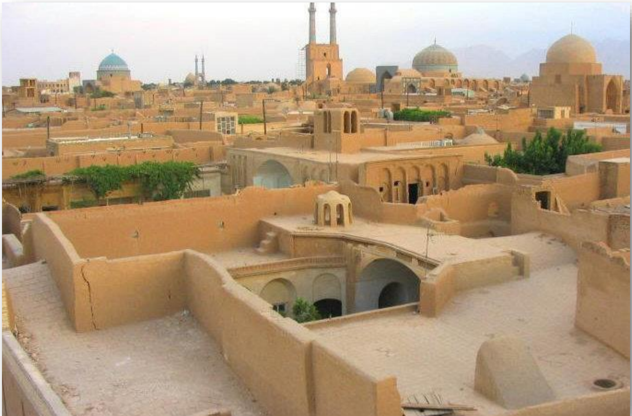
Windcatcher (Badgir), Yaz, Iran.