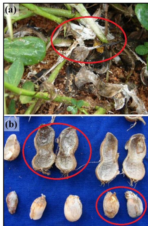
Fig. 1. a) Mycelium covering plant stems near the soil surface. b) Mycelium invading pods causing rotting of tissues

and Siddaramaiah et al. 1979[15] observed foot rot symptoms accompanied by girdling of younger plants and later such plants were succumbed to death. Mehrotra and Aneja, 1990[16] noticed the cortical decay of stem base at ground level and appearance of conspicuous white mycelium which extended into the soil and on organic debris. Symptoms of southern stem rot include wilting of individual stems, stem lesions, shredded stems and pegs, rotted pods, and plant death.