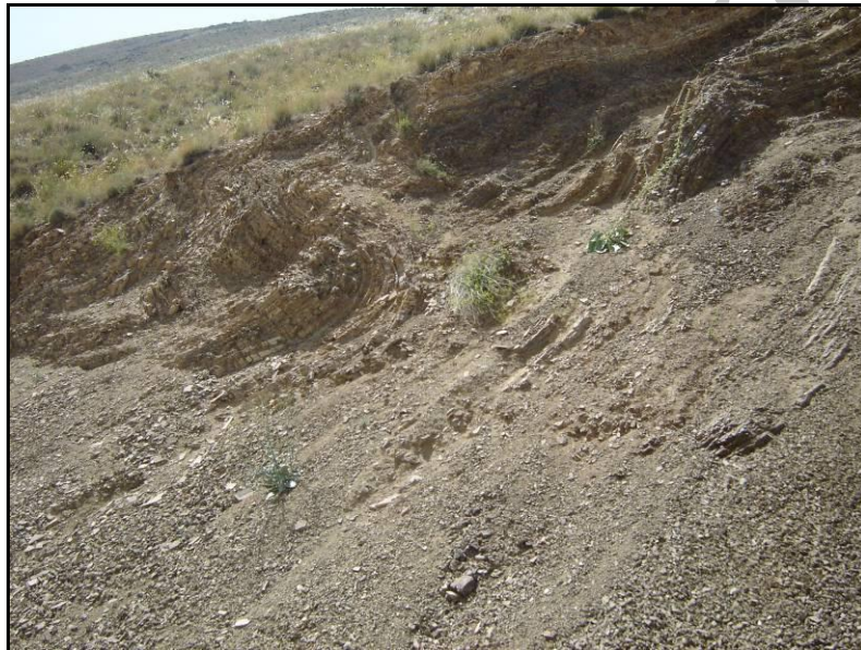
Fig.3 A part of Pourkan-Vardij fault zone

There are several faults in the tunnel route. The main fault zone and crushed zone is Pourkan-Vardij fault zone that cuts the tunnel route in 6417 to 6442 meter from end of the tunnel (Fig.3). It should be noted that CZ and FZ show crushed and fractured zones respectively due to fault activity.