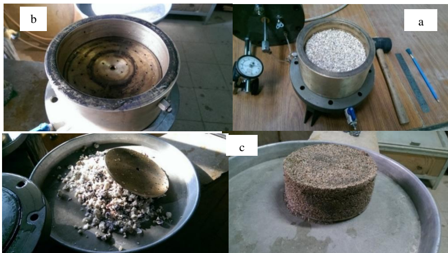
Figure 1. Material and apparatus a) Rowe Cell, b) Sand inside Rowe cell, c and d) Specimen after loading

(Figure 1). Poorly graded sand samples with big, medium and small size particles (in margins of sand definition) were tested.