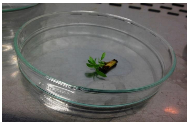
Figure 2. Explant collected from green-colored shoot of Iranian seedless barberry.

*Standard error; Shoot color: 1: Green, 2: Dark brown, 3: Light brown, 4: Pinkish.