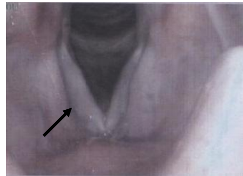
Figure 3. Vocal cord of the patient after treatment

A standard six month treatment with a combination of isoniazid, rifampicin, pyrazinamide, and ethambutol was started for two months followed by isoniazid and rifampicin for additional four months. The follow up after treatment showed resolution of the symptoms and improvement of the mass (figure 3).