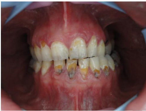
Figure 1. Severe dental decays in facial and cervical aspect of anterior mandibular teeth and cervical aspect of anterior maxillary teeth

Difficulty in swallowing dry food, continuous speaking, foreign body sensation and redness in eyes were the other problems which started about 2 years ago. Past medical history was unremarkable, besides consumption of nortriptyline 2 years ago for 1 year duration and also repeated restorative treatments for several carious teeth were done 8 years ago which eventually failed. The clinical oral exam by the dentist illustrated multiple dental caries (figure 1). No swelling and abnormalities were observed in the head and neck except red eyes and cracking of lips and oral corners. There was not any redness or thinning of oral mucosa. The primary treatment for dental health was the removal of acute caries and performing caries control process. The use of fluoride mouth wash, avoidance of cariogenic diet, chewing xylitol gum and good oral hygiene were recommended to him.