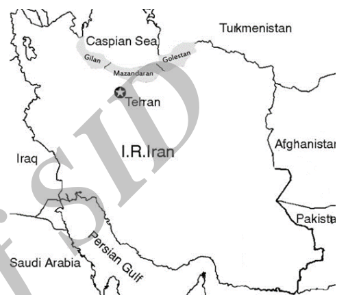
Figure1: Geographic situation of Gilan, Mazandaran and Golestan, Iran

(figure1). Data were collected retrospectively by reviewing all medical records of cancer patients registered in Cancer Registry Center of health deputy for Gilan, Mazandaran and Golestan provinces during a 6-year period (2004-2009) (23). The date of diagnosis was confirmed coded and was based on the International Classification of Diseases for Oncology (ICD-O).